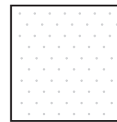
PIN DOT EMBOSS ON PAPER PE